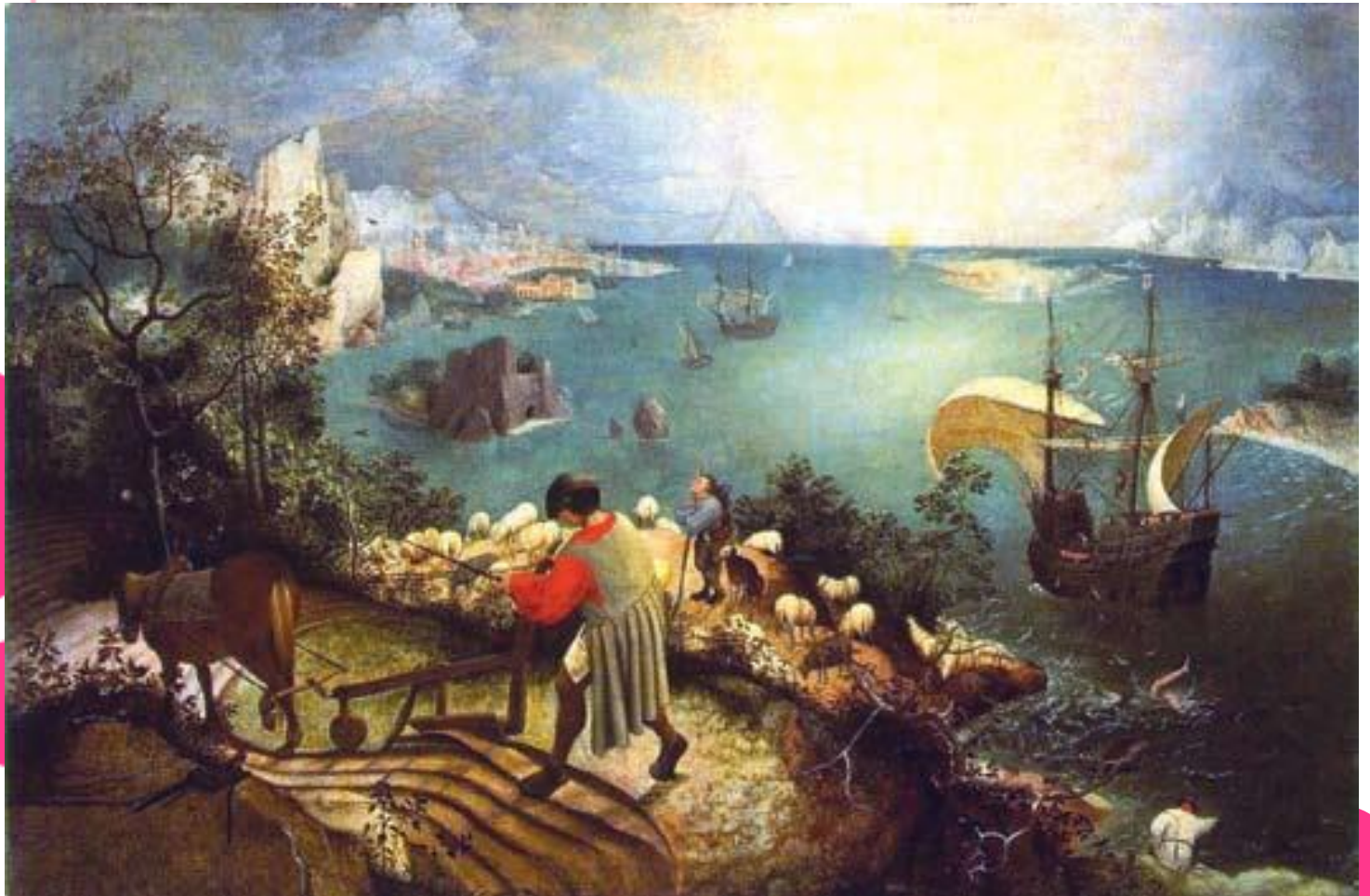
Pieter Bruegel- "Landscape with the Fall of Icarus"